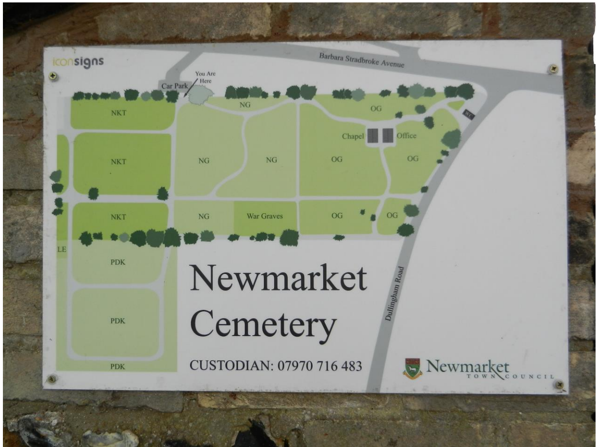
Newmarket Cemetery