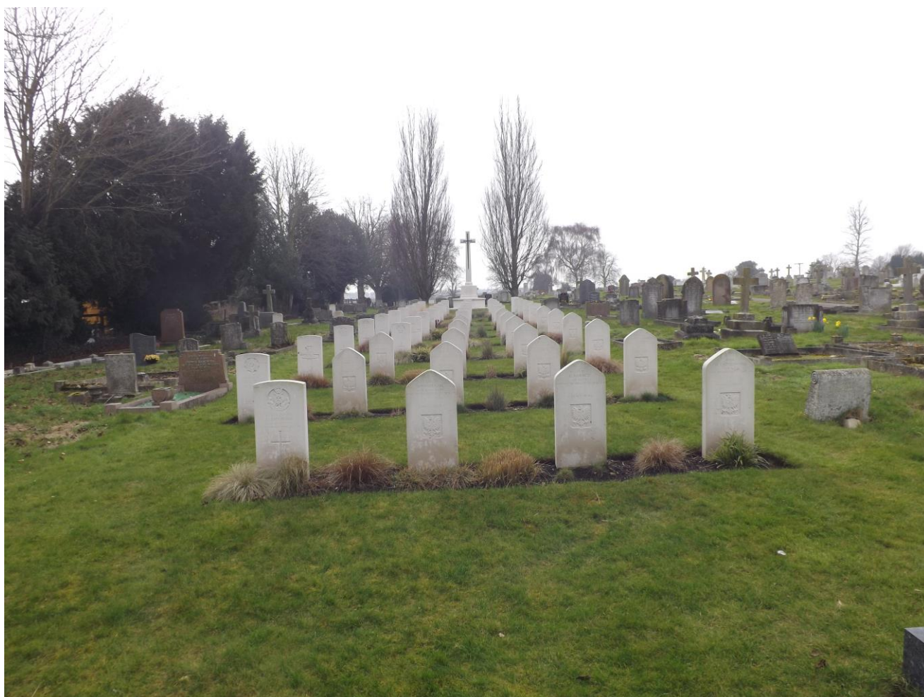
Newmarket Cemetery

Newmarket Cemetery, Newmarket, Suffolk contains 81 Commonwealth War Graves – 17 from World War 1 & 64 from World War 2 (which includes 20 Polish Graves).