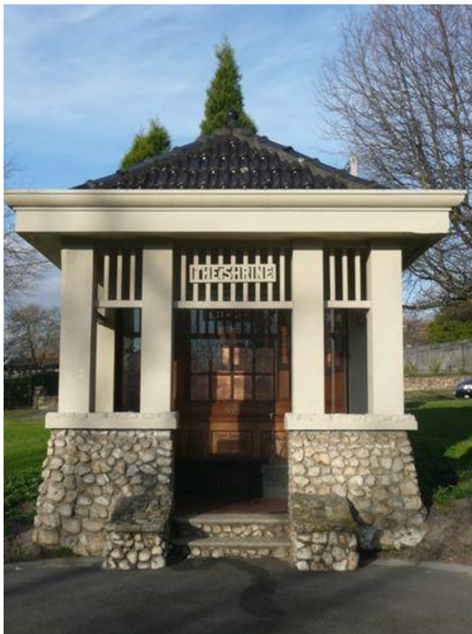
Surrey Hills War Memorial